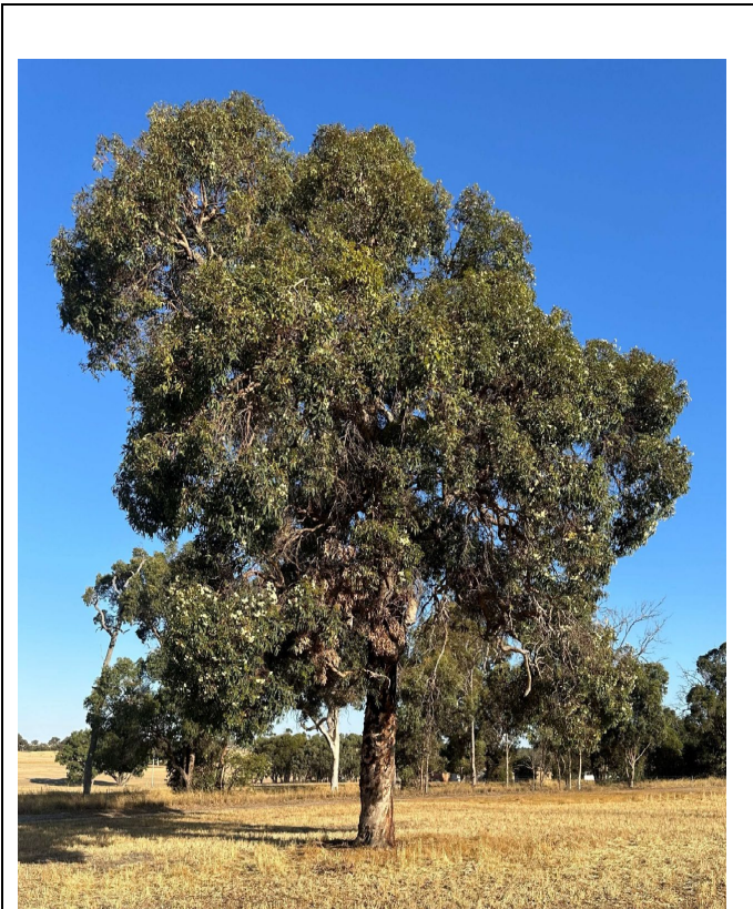
Figure 3. Photograph of Marri ( Corymbia calophylla ) tree proposed to be cleared (Saunders, 2024)